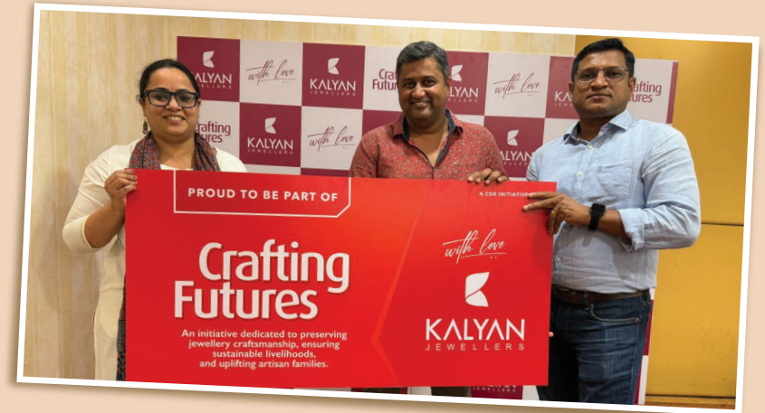
MOTIVATOR GROUP M Thrissur

Royal Touch Interiors has been associated with Kalyan Jewellers for over 18 years, with Kalyan being one of our marquee partners. Our journey together has been built on trust and excellence. We are proud to support the "Crafting Futures With Love" initiative and stand by Kalyan Jewellers in empowering artisans and preserving craftsmanship.