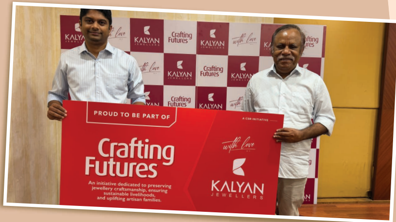
JOSEN Power Tech Electrical & Contractors, Thrissur

Motivator, a GroupM agency, is proud to be associated with Kalyan Jewellers on their inspiring "Crafting Futures With Love" initiative. GroupM, the leading media agency has been a trusted partner of Kalyan Jewellers since 2007.